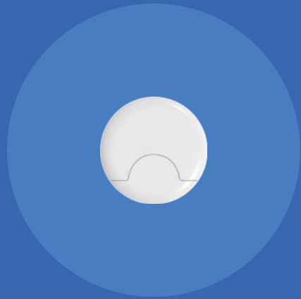
Nano Pro CGMS